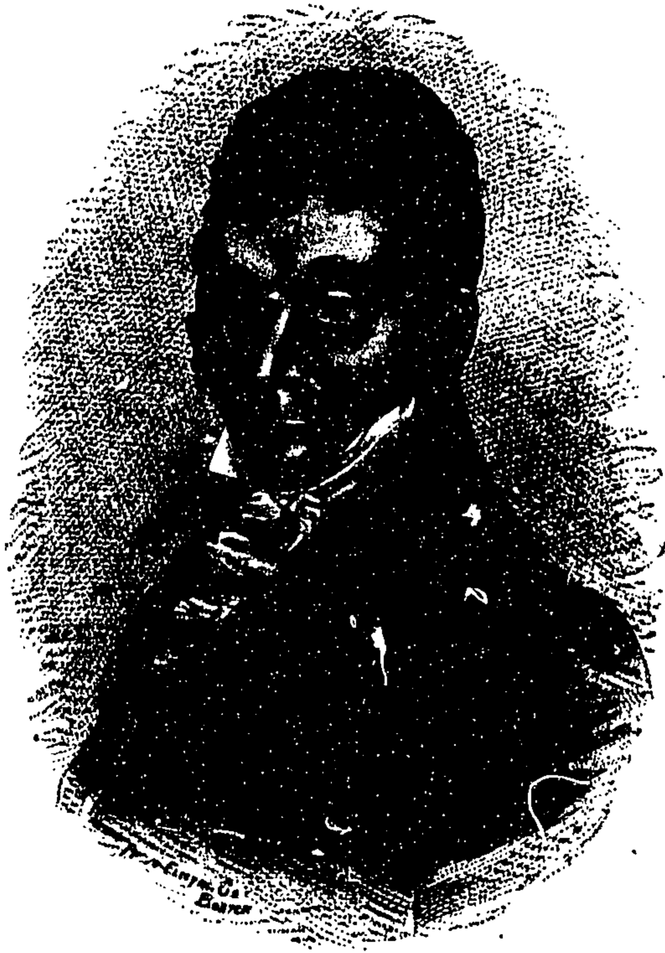
WEBSTER IN EARLY MANHOOD.